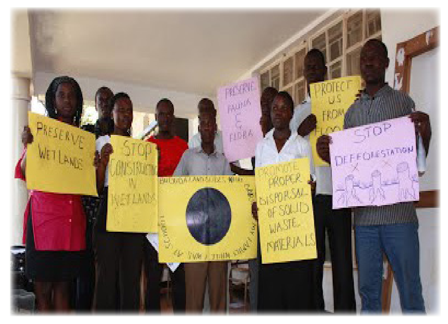
Youth skill training during the climate impact day.