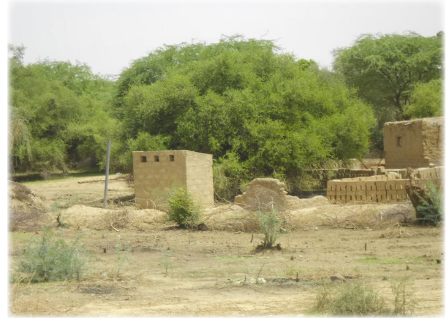
Behind the Genetic Resource Centre is the big garden for plant proliferation and seed production.