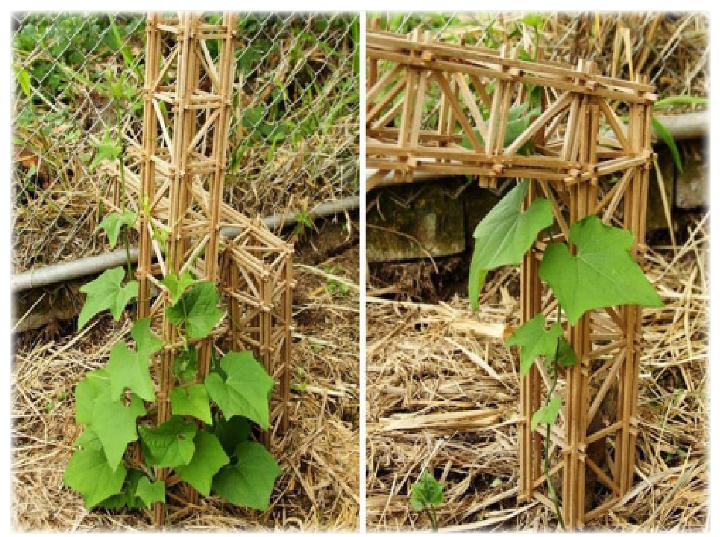
Working on horizontal gardening.