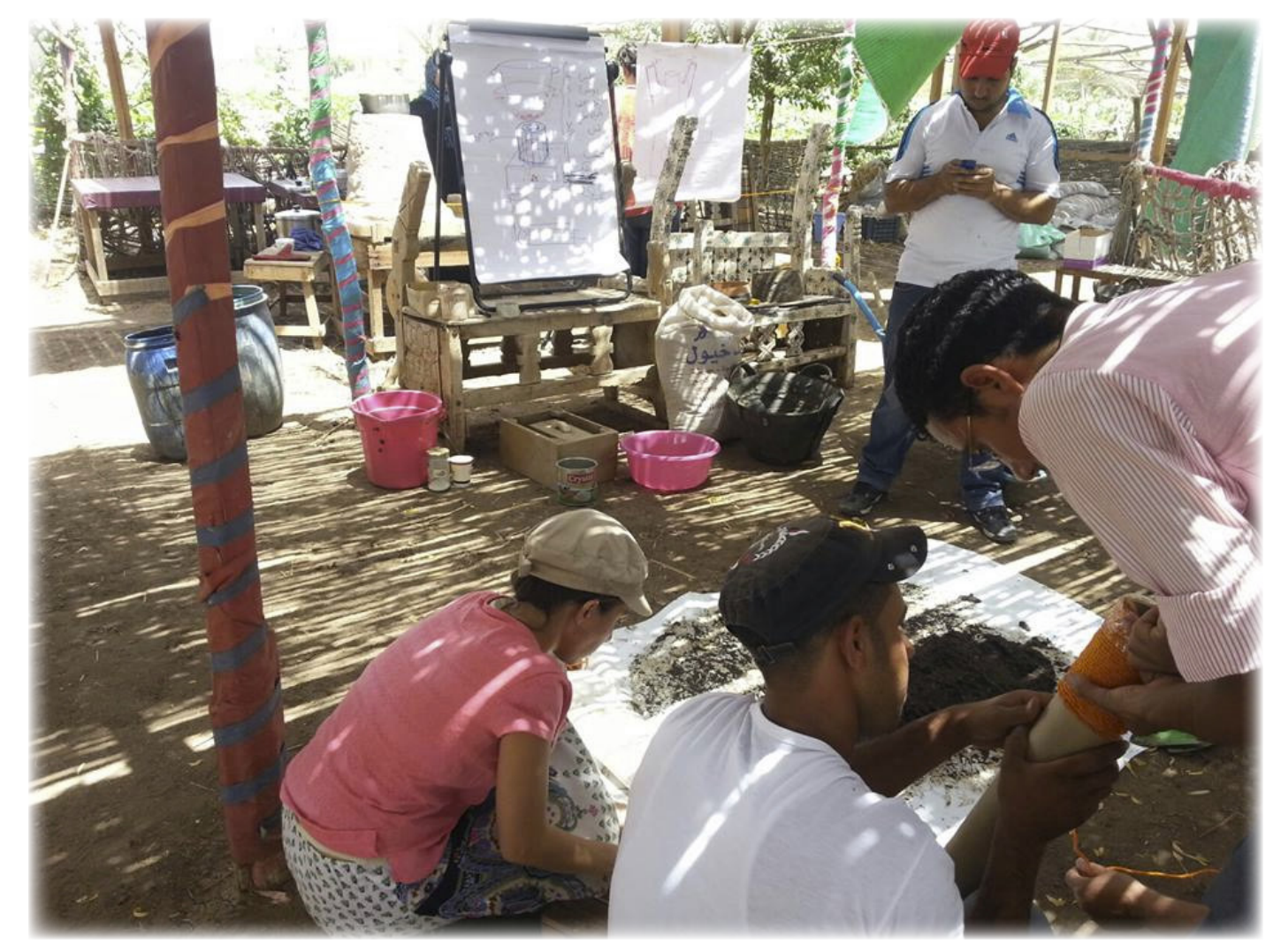
With advice, participants making "rocket stoves", a very efficient substitute for a common stove.

Workshop on Effective Micro-organisms - under the table, Nawaya's first green product: Bokashi kits to make super-compost.