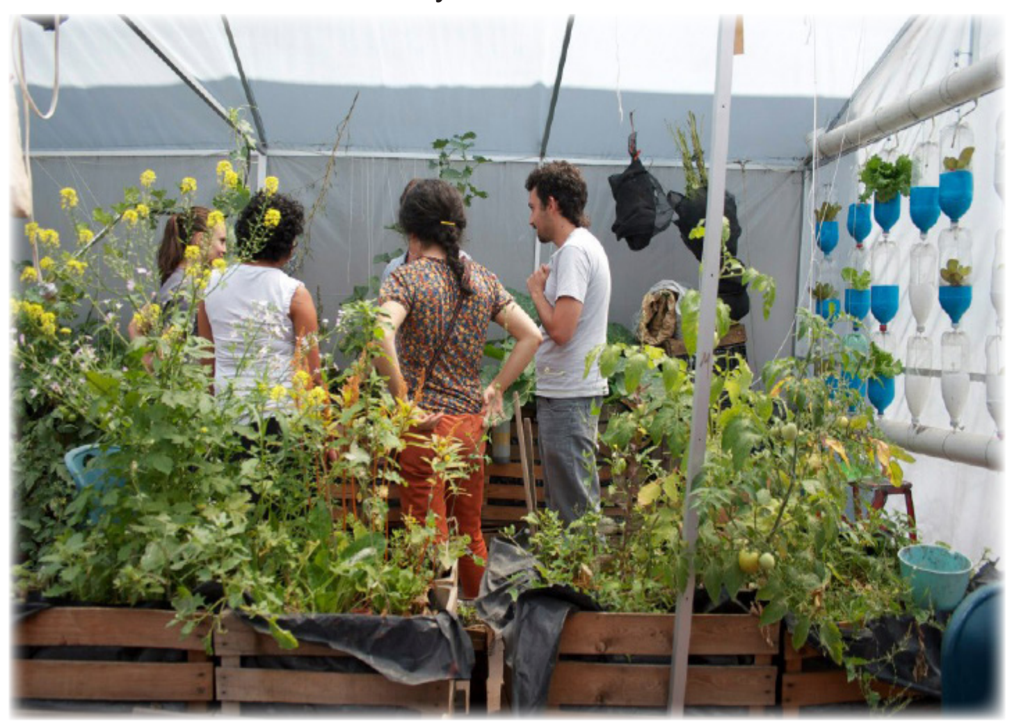
Harvesting veggies with workshop participants and locals on the green roof top garden in San Juan/Mexico City build by CUALTI

Building up a green community roof garden with locals in San Lorenzo Tezonco, Mexico City D.F.