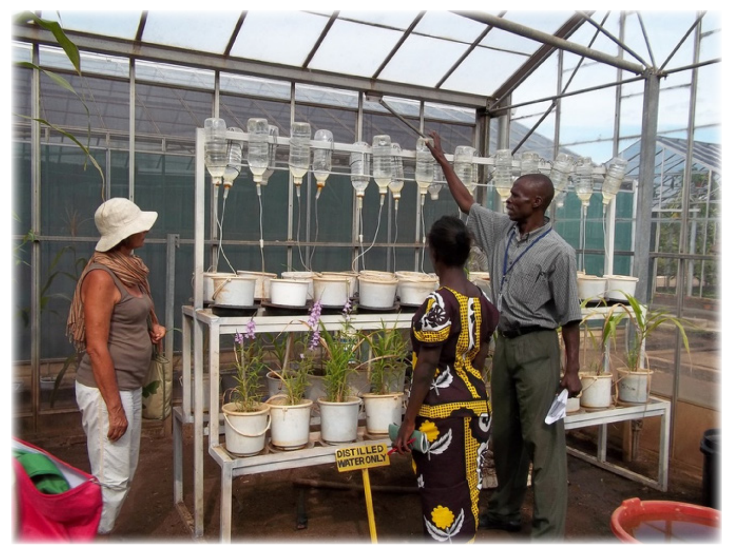
With basic materials it's possible to build a working irrigation system. UV-rays are passing through PET and kill germs.