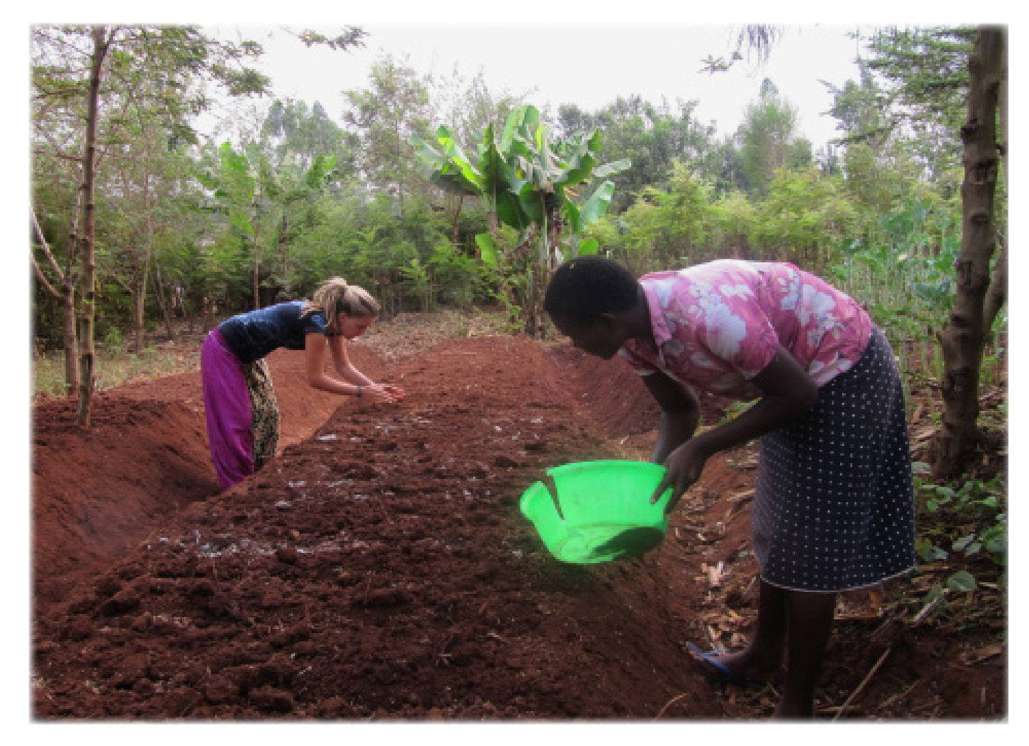
Planting of vegetables on the new beds.