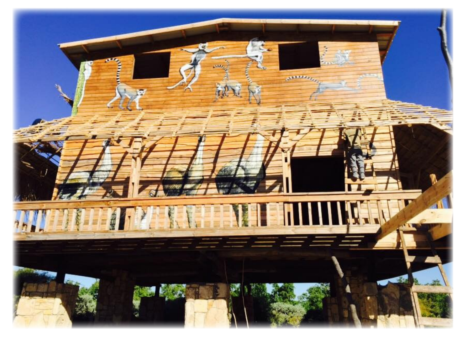
The new sustainable accommodation is ready.