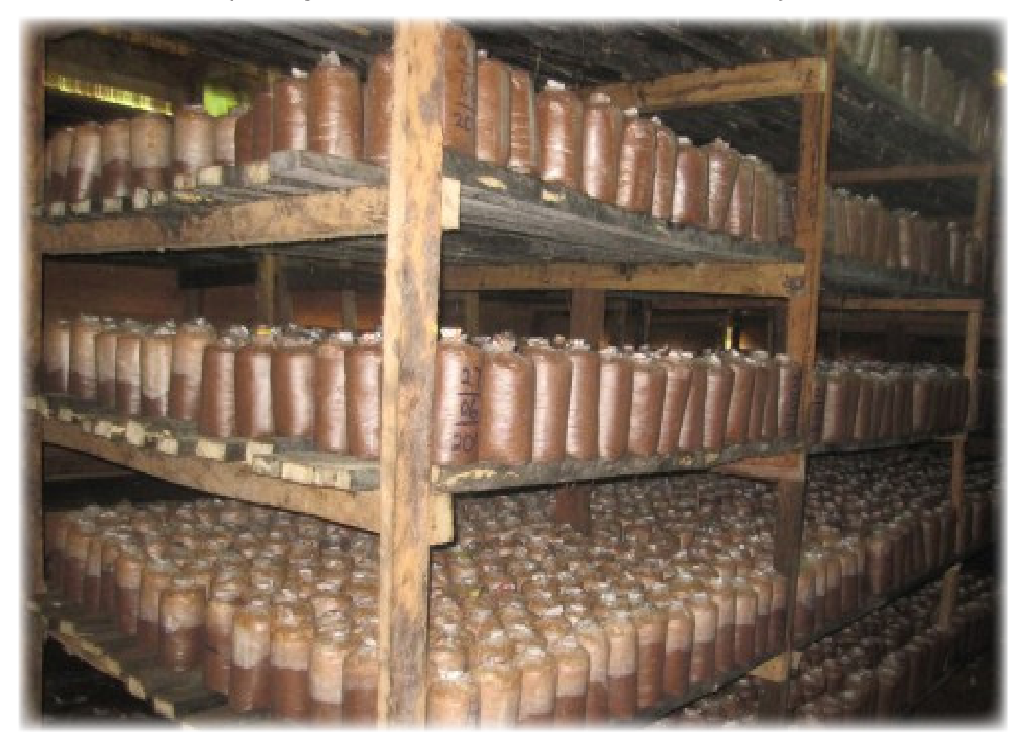
Storage room for bags filled with substrate and fungal spores.

Up to 20.000 young plants find shelter in the nursery.