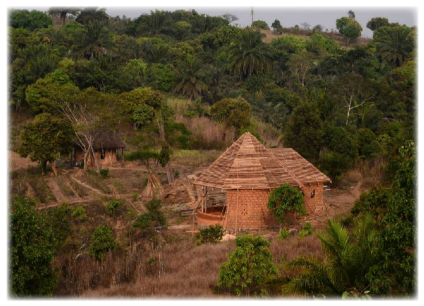
Late afternoon light on the site from the entrance road.