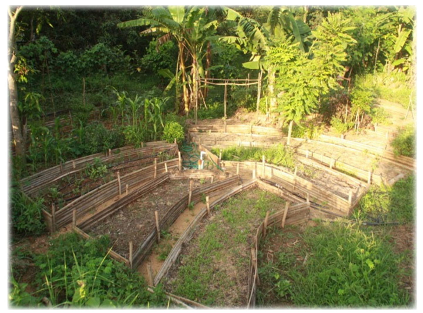
The kitchen garden is build right in front of Sala and kitchen. Keeping the distance small for watering and daily harvesting.

The communal structure -Sala- at the Panja Project.