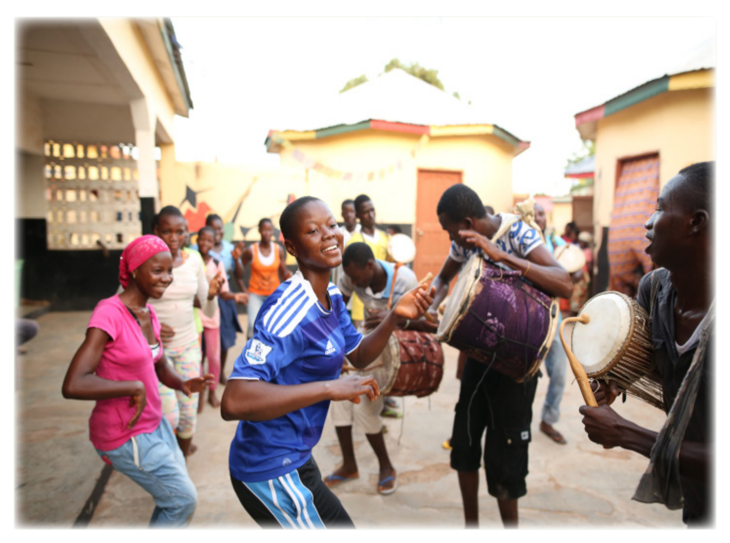
Dance and Music course at Bizung School.