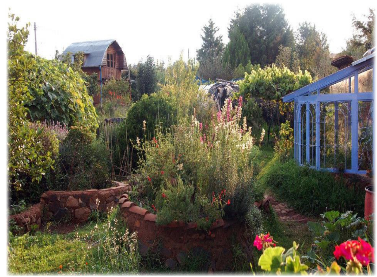
Community Centre with the garden -"zone1" and "zone2".